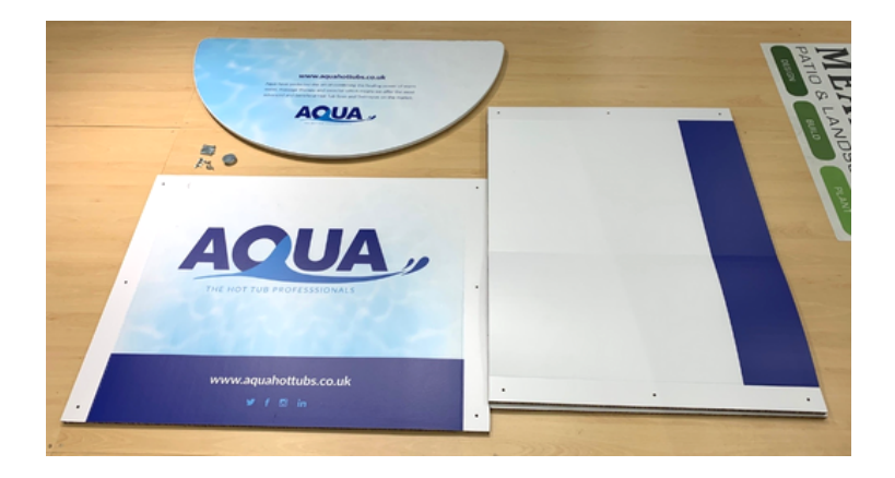
You'll receive x2 side panels, front panel, counter top and fixings.

Scan our QR code to view the full assembly video